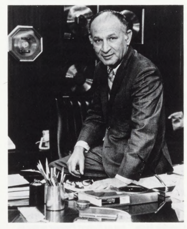
LEONARD CHESS Born March 12th, 1917

Born January 10th, 1917 New York, New York